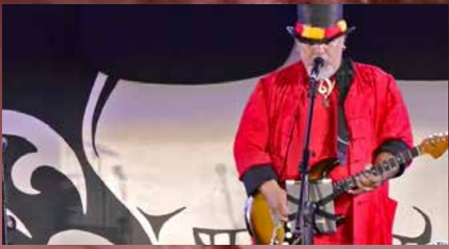
Howlin at The Moon