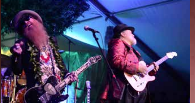
I Love A Woman